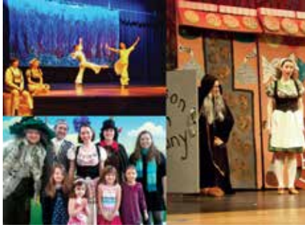
Admission is free. All children and adults are welcome.

A children's opera will take place in the Multipurpose Room in lieu of the Time with Children at the 11 a.m. service. The Ensemble, which consists of five members, four singers and a coach/accompanist, will present a staged version of a work they have created. The opera takes place in an "international" bed and breakfast and uses music from several great operas to teach diversity and acceptance.